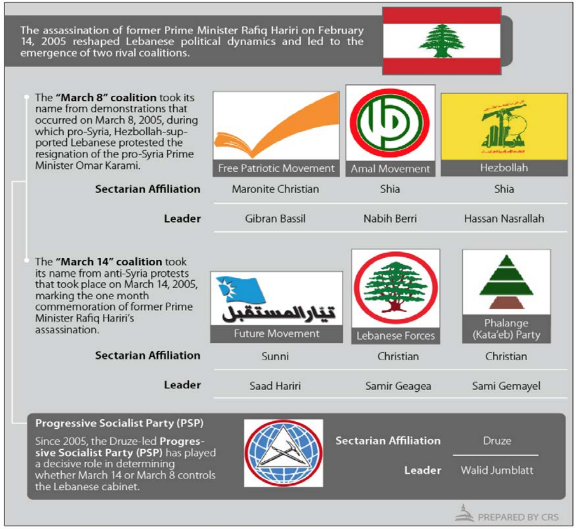
Figure 4. 49

their interests and fractioning the relationships among parties within them, further weakening these already loosely held coalitions. Since 2005, the Progressive Socialist Party (PSP), from the Druze sect has played a decisive role in swinging votes and decisions in favor of either the March 8 or March 14 coalition. Figure 2, below provides a visual representation of the coalitions since 2005. That being said, the relationship between the parties is not uniformly religious as the two main coalitions are a mix of Muslim and Christian parties. Since 2005, the coalitions have evolved and gone through various stages of change and although some ties within coalitions have weakened the main bi-coalition framework exists in the Lebanese government today. 48