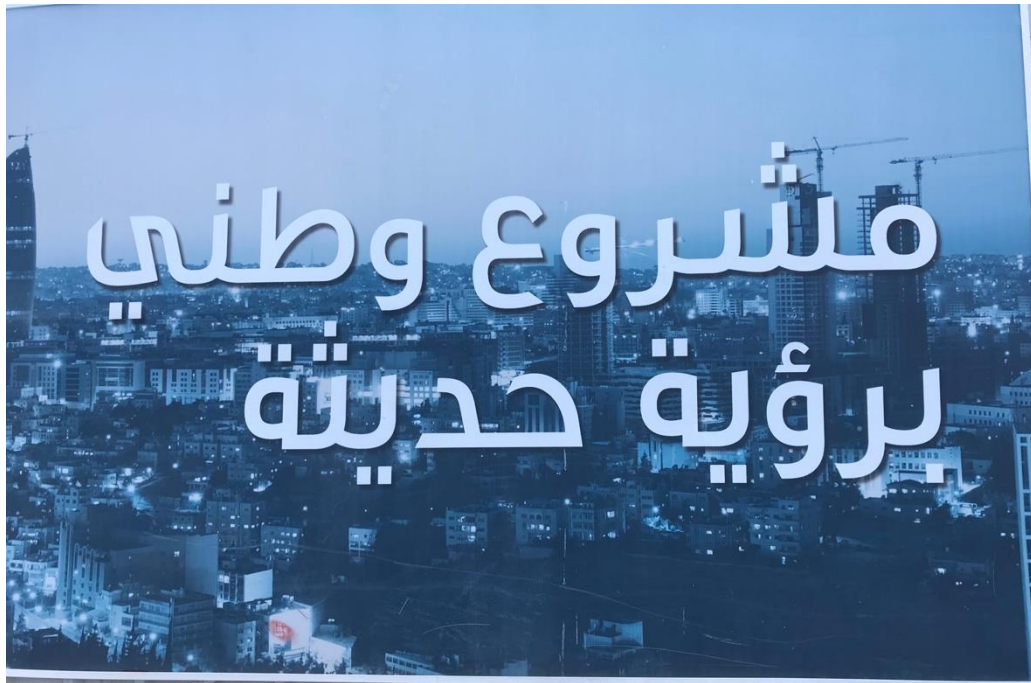
Image 7: Advertisement for Abdali in Amman. It reads, “A national project with a modern vision.” Advertisements like this one are plastered across Amman.