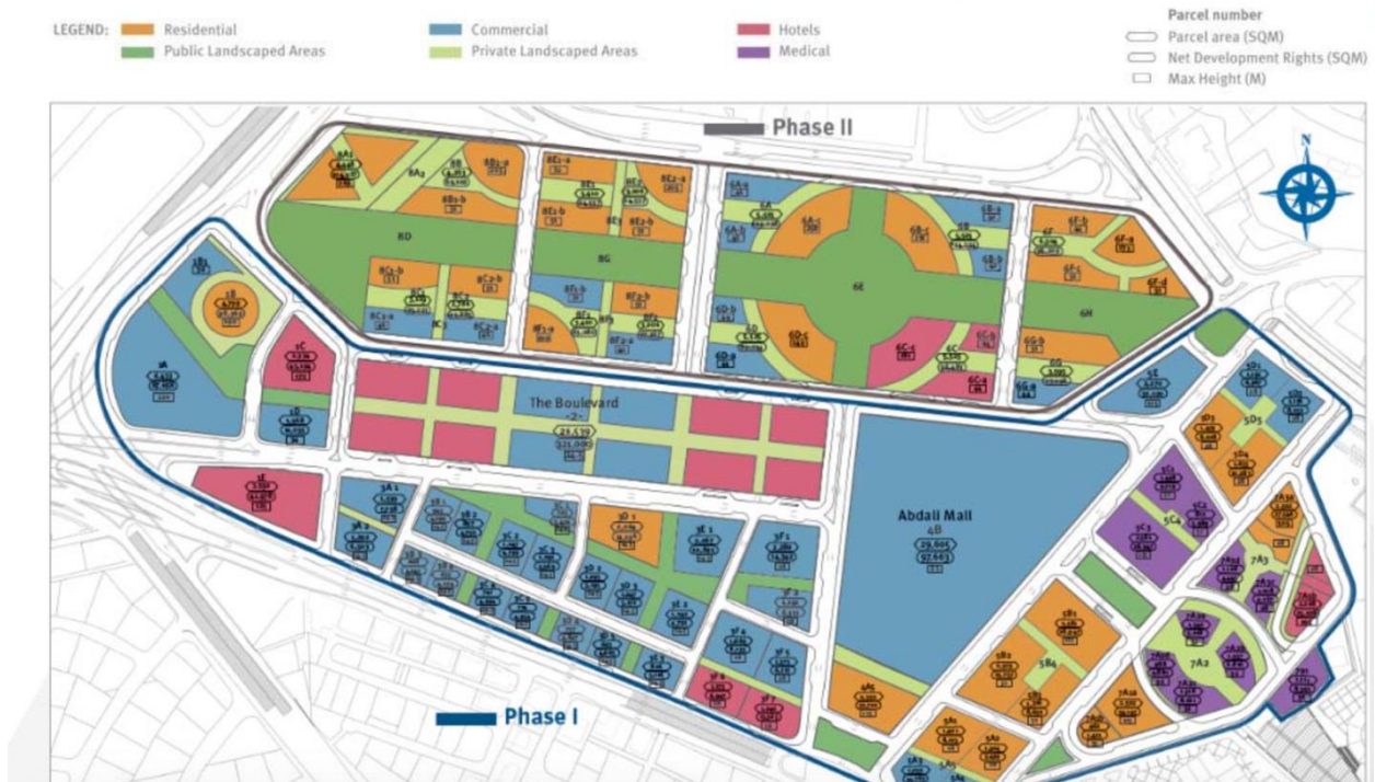
Image 4: Abdali PSC sketch of land usage for the project. By percentage: 49% residential, 20% retail/commercial, 17% offices, 11% hotels, and 3% medical.