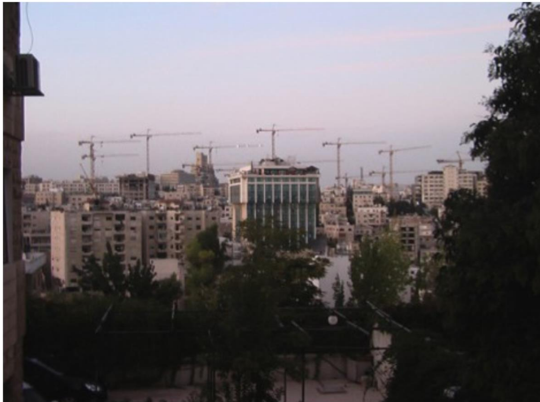
Image 6: The construction of Abdali from 3 rd circle. Daher has called these the “minarets to neoliberalism.”