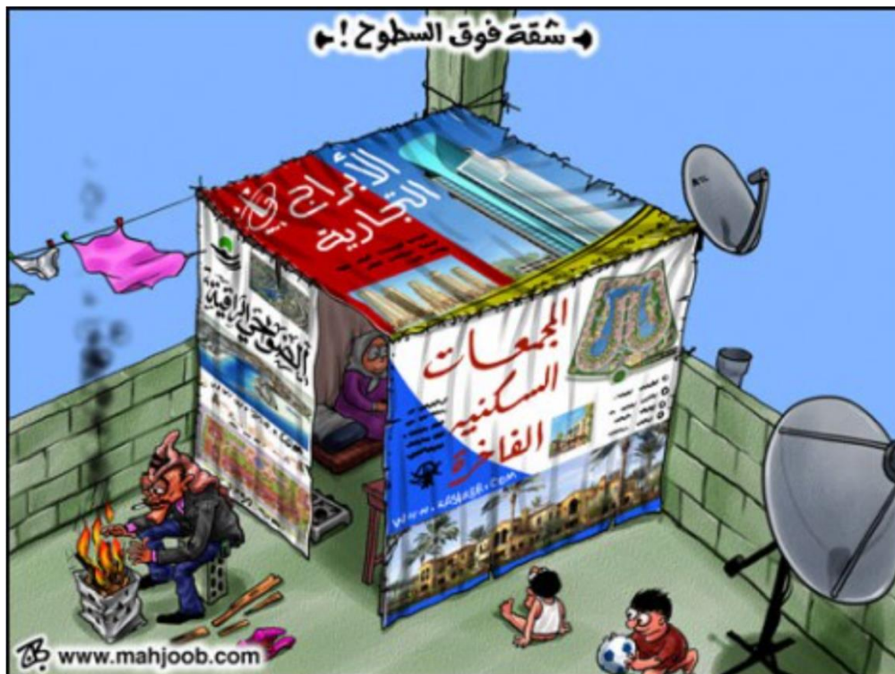
Image 8: The actual use of such advertisements for Ammanis. Famous caricaturist Abu Mahjoob titled this cartoon “An apartment above the roof,” highlighting the obsessions with living in towers, while sarcastically demonstrating the inutility of these projects to most Ammanis, they cant even afford a home let alone luxury apartments. (Courtesy of Abu Mahjoob.)