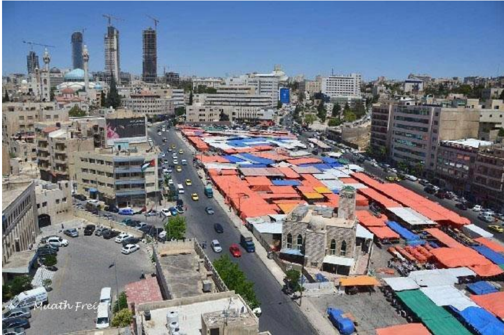
Image 5: Abdali Friday Market before its dispossession and ‘beautification’ in 2014. Note the construction of the towers in the background.