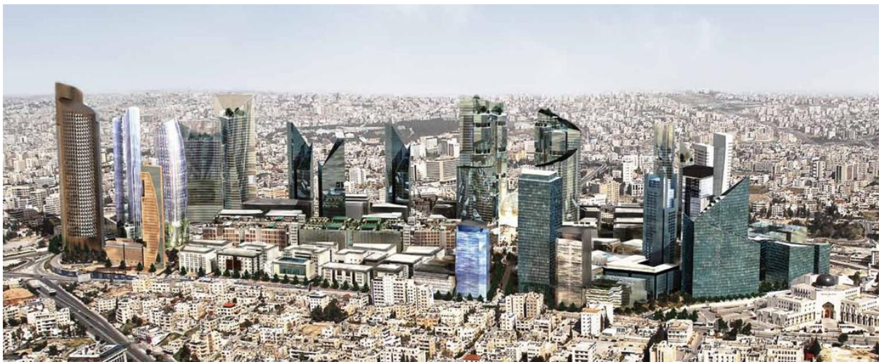
Image 2: Abdali PSC's rendition of the New Amman. This is the Global City that Amman strives to be, with developments and towers reminiscent of Dubai, Beirut, Doha and other global or globalizing cities.